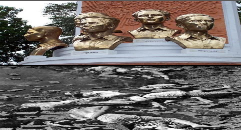
Embodies & dead bodies of language martyrs.