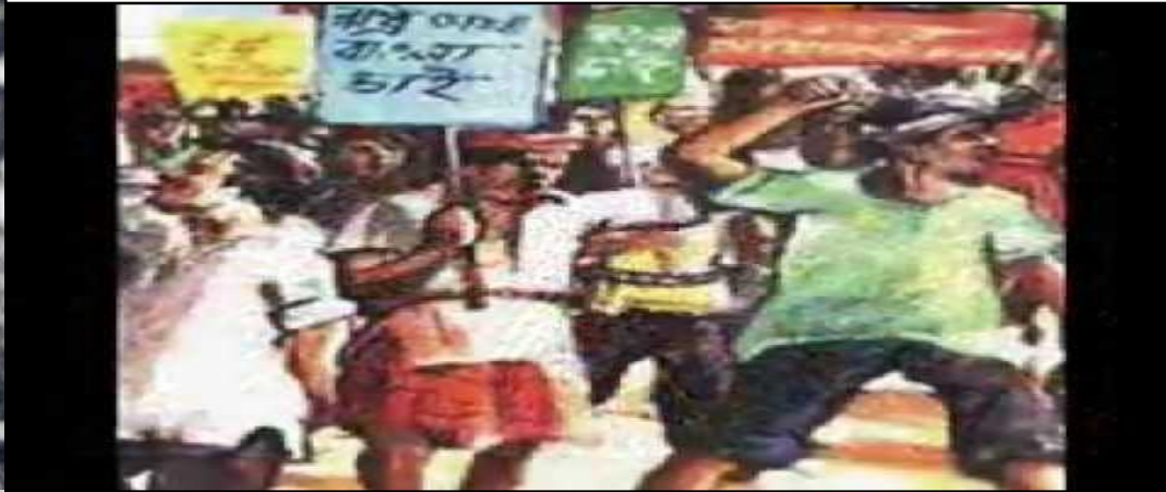
Language movement for State Language.