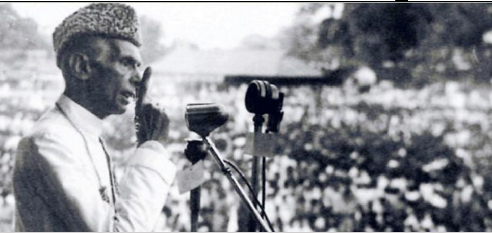
Speech of Ayoub Khan of Pakistan.